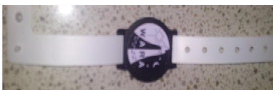
Electronic tag attached to wristband.